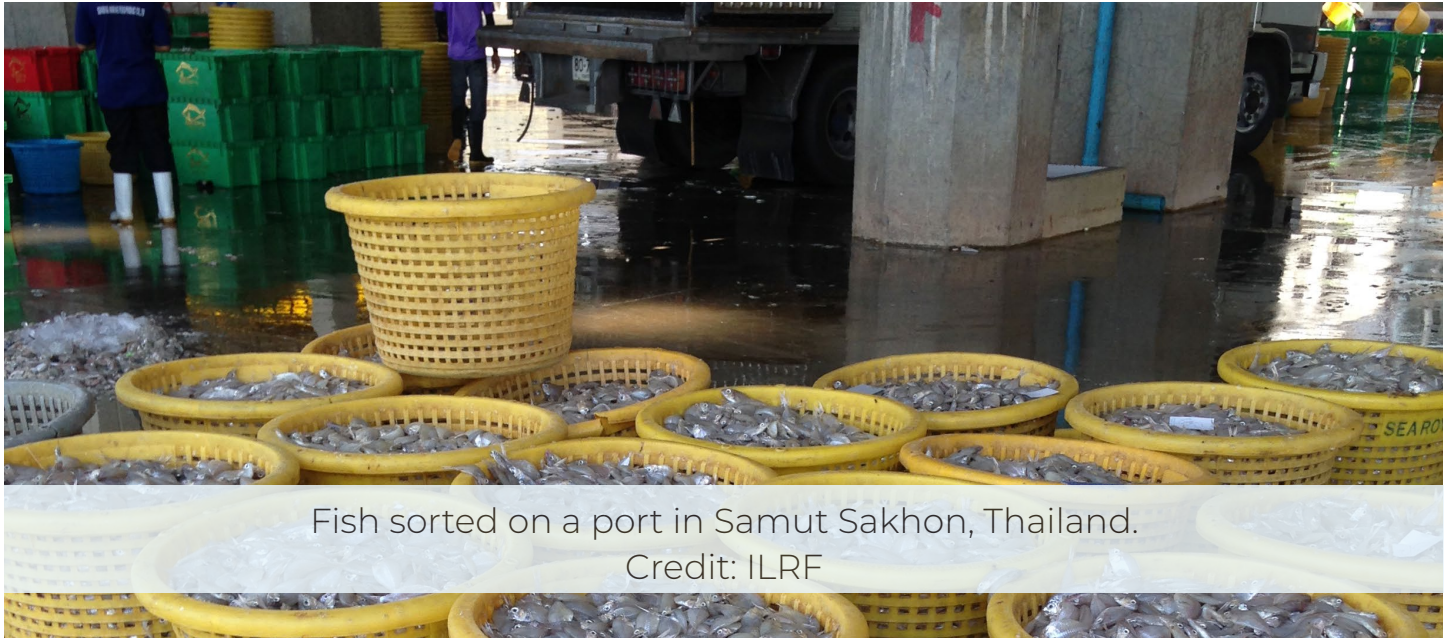
Fish sorted on a port in Samut Sakhon, Thailand.

the Thai Frozen Food Association (TFFA) – an industry group of major exporting companies – announced that its members would bring all shrimp processing in-house. While this move improved supply chain transparency and ended informal outsourcing that put workers at risk, its implementation resulted in the immediate closure of dozens of workplaces that employed vulnerable populations, making the suddenly unemployed workers more susceptible to further exploitation. 102