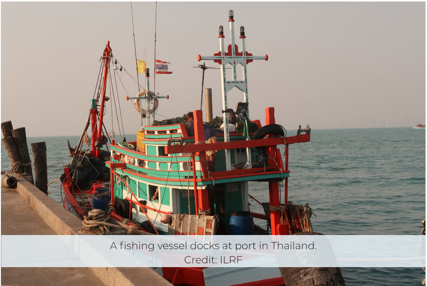
A fishing vessel docks at port in Thailand.