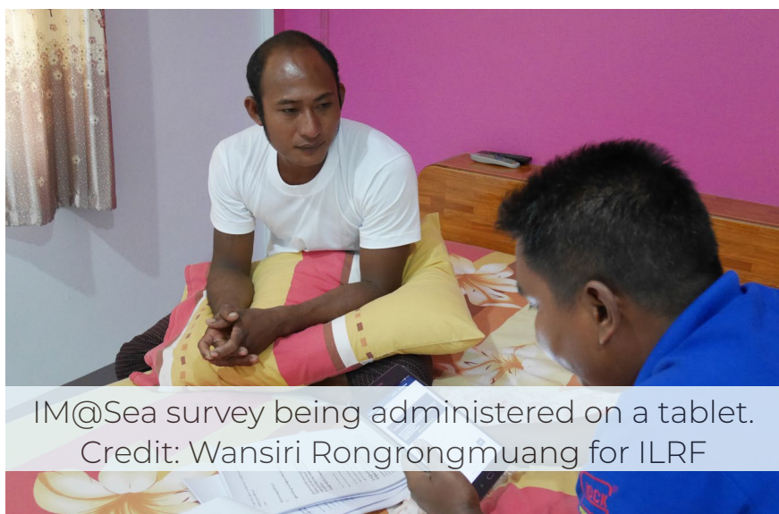
IM@Sea survey being administered on a tablet.

The division of at-sea versus on-shore questions should be carefully considered in constructing a risk assessment system like the IM@Sea pilot. Some conditions of work change daily, others remain static and still others may need to be assessed on some other periodic basis. The presence of contracts or details about recruitment into work, for example, won't change day to day and can be better assessed in port-based data gathering. Working hours were chosen as the topic for at-sea questions in IM@Sea because they do change daily and can be checked against other responses and/or employment documentation. Other relevant information, such as availability of food and potable water or regular payment of wages, might be useful to gather at sea, but at a relevant time interval that isn't daily.