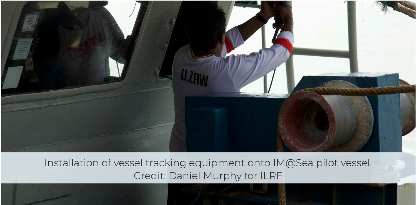
Installation of vessel tracking equipment onto IM@Sea pilot vessel.

pound – some of which goes directly into increasing farmworker salaries and some of which goes to support for the program’s worker-driven monitoring and enforcement mechanisms.