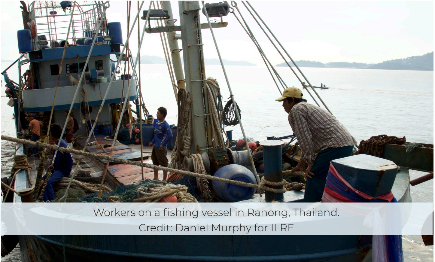
Workers on a fishing vessel in Ranong, Thailand.