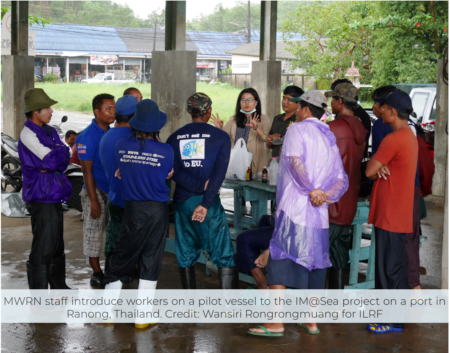
MWRN staff introduce workers on a pilot vessel to the IM@Sea project on a port in Ranong, Thailand.

consultative period between the first draft of the worker surveys and their administration to the workers. ILRF and MWRN convened a focus group of four Burmese migrant fishers based in the Thai coastal region of Samut Sakhon to elicit feedback on the language, format, and content of the surveys. Over four hours of discussion, MWRN and ILRF obtained important worker input on which aspects of the surveys needed revisions before the worker interviews could be conducted. Following this consultation, ILRF revised portions of the surveys to reflect the workers' perspectives and noted where further revisions should be made in future iterations.