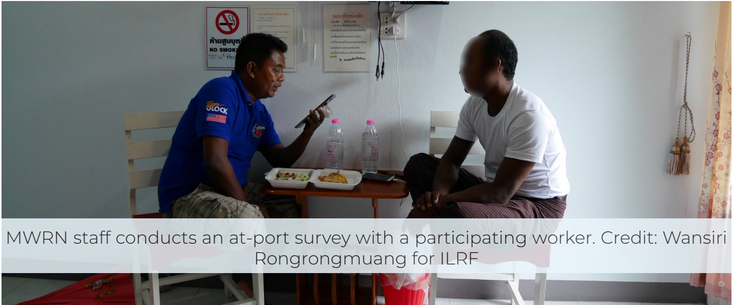
MWRN staff conducts an at-port survey with a participating worker.

215 to 4,880, out of a possible 6,520 points. The higher the point value, the higher the risk of forced labor. 65