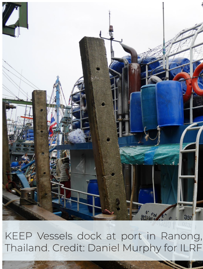
KEEP Vessels dock at port in Ranong, Thailand.

To build trust with the Burmese migrant fisher beneficiaries of the project, ILRF and MWRN prepared and implemented a full briefing on the various components of the IM@Sea pilot, including the operational-level grievance mechanism linked to the forced labor risk assessment. The migrant fishers were informed about the purpose of the pilot and the expected outcomes – improved employer practices and labor conditions – as well as the safeguards ILRF put in place to ensure the mechanism was free from undue influence by the vessel operator. Due to time and resource constraints, worker feedback on the mechanism's performance was not obtained. Future initiatives should seek worker input on and support for subsequent