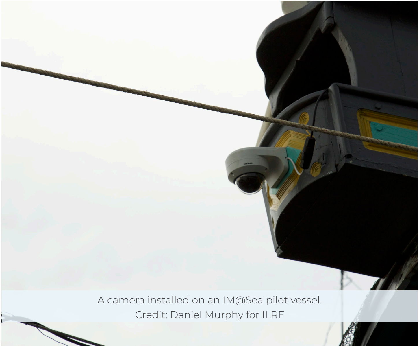
A camera installed on an IM@Sea pilot vessel.

record of working hours with the workers' at-sea survey responses and consulting with the ILO. The video data was ultimately irretrievable, 89 but ILRF did formulate this recommendation on working hours based on ILO guidance: 90