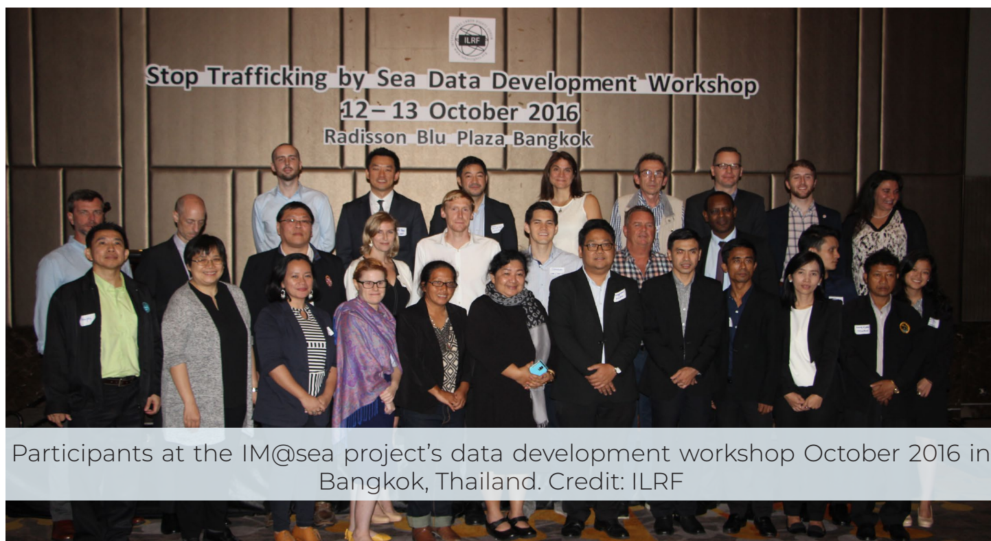
Participants at the IM@sea project’s data development workshop October 2016 in Bangkok, Thailand.