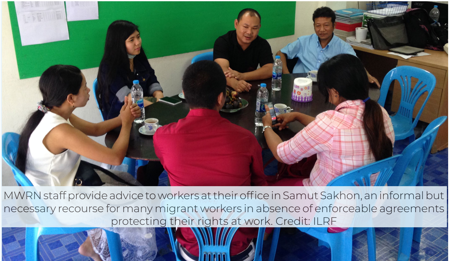
MWRN staff provide advice to workers at their office in Samut Sakhon, an informal but necessary recourse for many migrant workers in absence of enforceable agreements protecting their rights at work.

Businesses that provide access to remedial mechanisms, but do not provide effective remedy at the end of the grievance process, are neither accountable to their workforce nor to society at large. 80 For brands/retailers to fulfill their responsibility under the UNGPs, and demonstrate accountability, they must provide effective remedies for violations of workers' human rights which they have caused or contributed to. 81 The best way to guarantee this is to enshrine such obligations into a legally-binding agreement that may be enforced by representatives of aggrieved workers through binding arbitration and/or in a court of law.