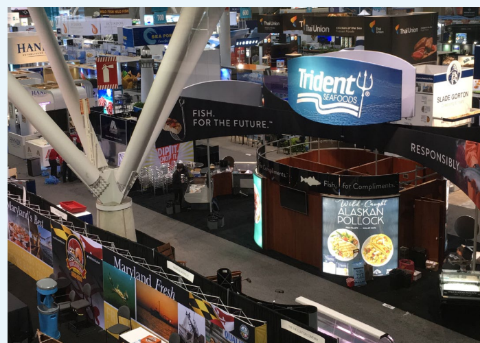
Seafood companies display at the annual Seafood Expo North America in Boston, Mass.

and subsequent progress towards full remediation. Human and labor rights violations cannot be remedied if they cannot be found. Remedies cannot be effective unless workers and their representatives can assess them and improve upon them when they are found to be deficient. Those at the production level of seafood supply chains will continue to struggle to improve conditions that are effectively set by brands’ pricing decisions unless purchasing practices change to more closely reflect the day-to-day realities of fishing and seafood processing operations.