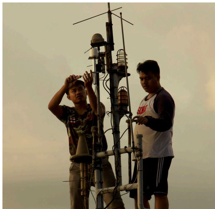
Technicians install technology for the IM@Sea project.

While the hardware issue was a major concern, software issues also hindered implementation of the onshore and at-sea surveys. MWRN interviewers struggled at times administering the onshore survey on a Lime Survey platform that itself had compatibility challenges with the IM@Sea survey as it was originally developed. Due to several changes in the technology used and a compressed timeline for implementation as a result, MWRN was not familiar enough with the tech aspects of the at-sea survey to adequately train the crew on how to access the survey once at sea. Ideally, technology solutions will “meet workers where they are,” utilizing technology that workers are already familiar with. Where specialized technology is required, worker organizations representing migrant fishers need to have sufficient time to learn how to use technological devices and platforms central to projects like IM@Sea. Participating workers need adequate tech training in order to ensure they are able to access reporting mechanisms, especially when they need them the most.