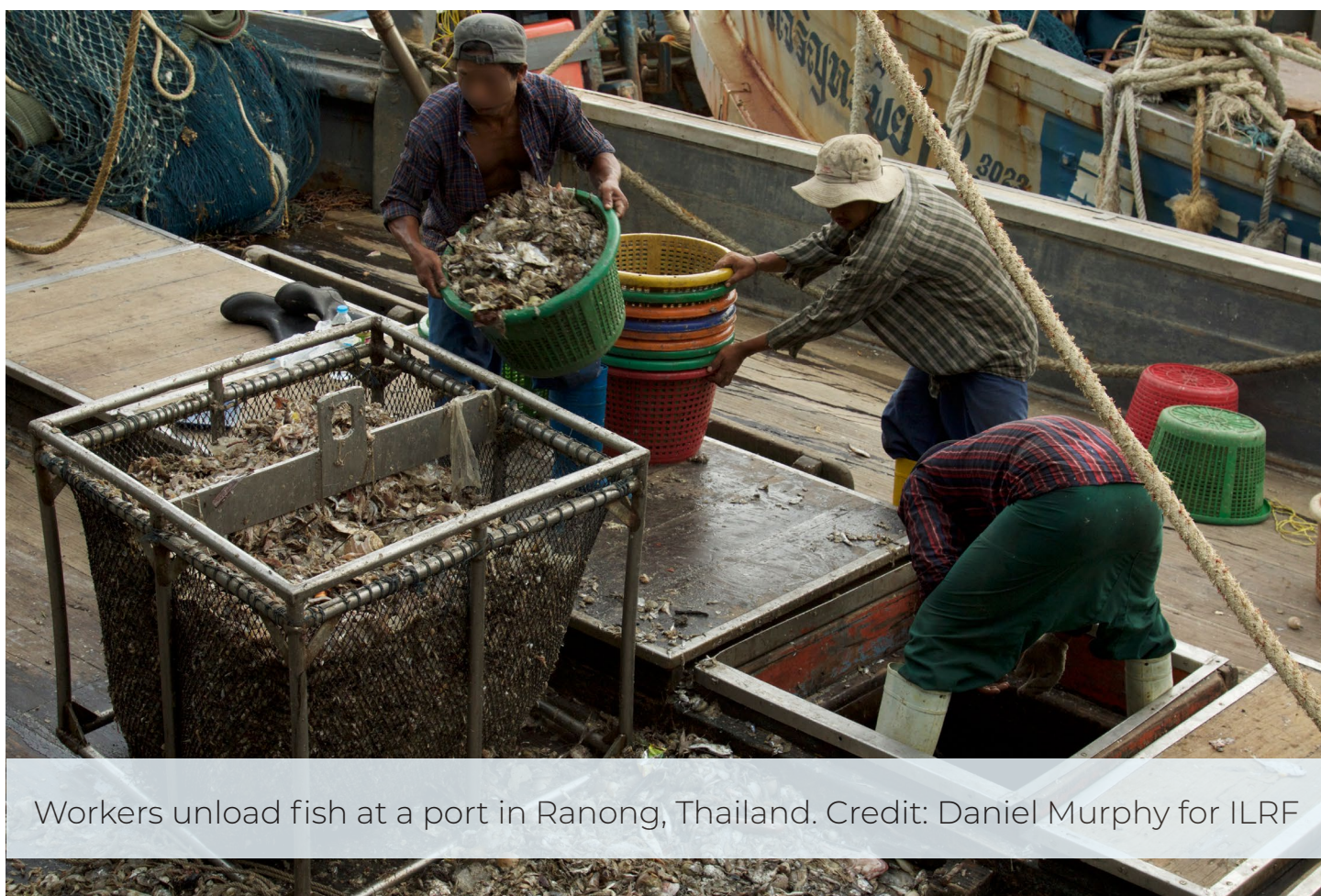
Workers unload fish at a port in Ranong, Thailand.

Access to effective remedy is predicated on aggrieved workers' reasonable access to sources of information, advice and expertise necessary to engage in a grievance process on fair, informed, and respectful terms. The IM@Sea grievance mechanism was thus designed to place participating workers in an equitable position incase issues arose during the pilot that required