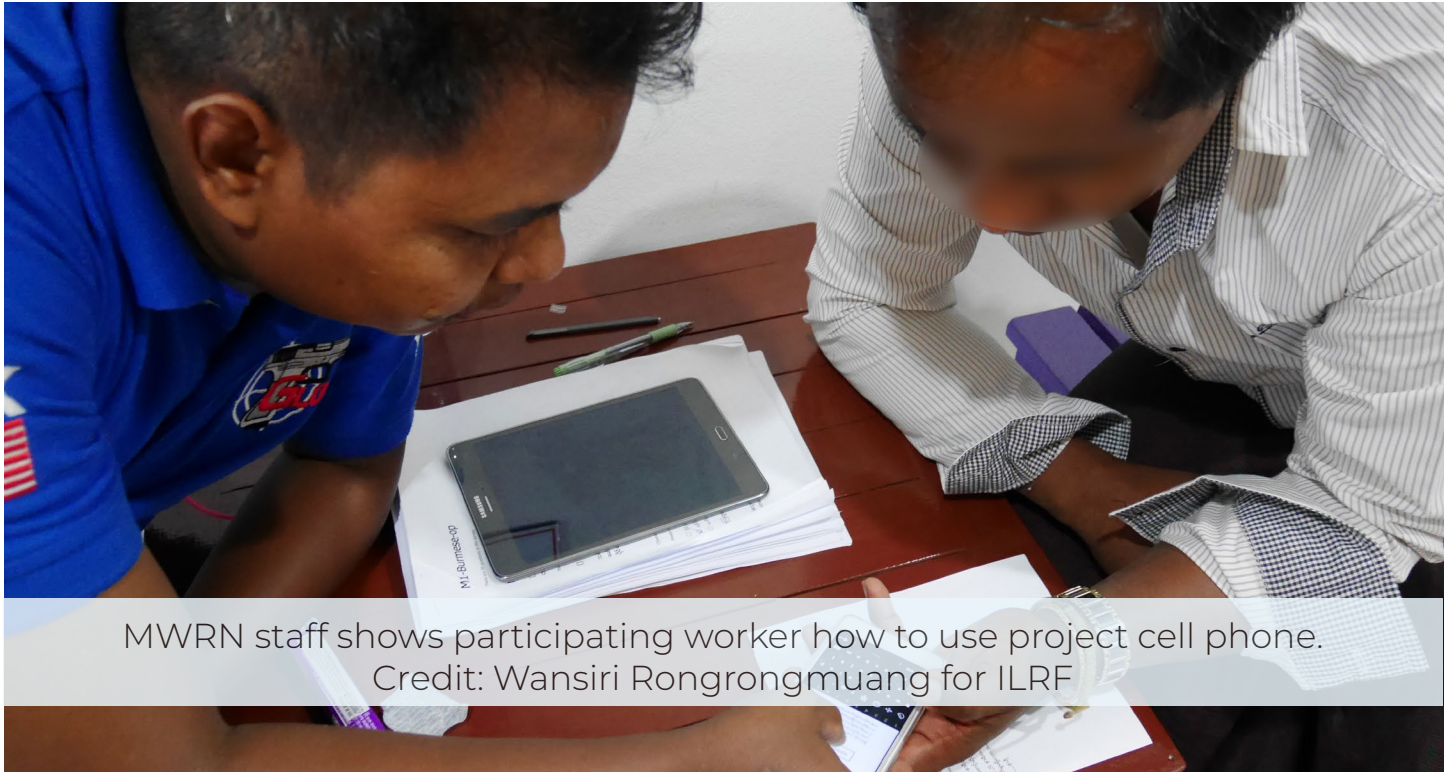
MWRN staff shows participating worker how to use project cell phone.

migrant fishers, it would be impossible for it to represent all, or even a large majority of Burmese crew in the Thai fishing industry. To scale the Essential Elements model across all or most of the Thai fishing industry, the Thai government must amend its labor law to allow migrant workers, including migrant fishers, to organize and lead their own unions. Migrant fishers unions, if organized at each major fishing port, would be the natural worker representatives of deckhands who form bargaining units on each fishing vessel. This organic growth of unions, paired with growing recognition from Thai employers and buyers for signed agreements with workers, could facilitate implementation of the Essential Elements model across the Thai fleet.