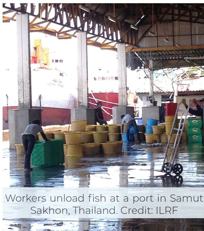
Workers unload fish at a port in Samut Sakhon, Thailand.

effective implementation of laws to protect vulnerable populations. 32 The Thai government has also failed to put in place systems that empower migrant workers to seek legal remedies against abusive employers. The most recent research from the ILO found that though 57 percent of migrant workers surveyed reported that they had experienced serious labor abuses only 26 percent sought help, and only a small percentage of those were actually able to resolve their problem (13 percent reported the problem was resolved, 11 percent reported it was partially resolved). 33 The report also found that 42 percent of respondents want to join a trade union or worker association, but only 10 percent have actually been able to do so, and noted that Thailand maintains legal prohibitions that limit migrant workers' ability to freely associate and collectively bargain.