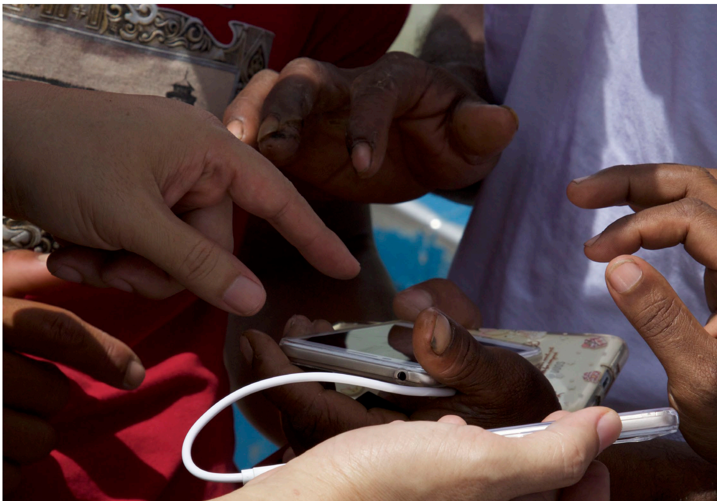
Workers receive training on how to use project cell phones to respond to at-sea survey questions.

MWRN about retaliation, but the rights-training necessary for a comprehensive and effective worker-driven complaints mechanism was beyond the limits of the project. Efforts, instead, were focused on testing a suite of technological tools for labor risk assessment purposes. As explained in the section below, real-time information from fishers on their working conditions at sea, especially working hours, is critical to reliable forced labor risk assessments and effective human rights due diligence in the fisheries sector. Since access to electronic communication devices is a prerequisite for worker-driven monitoring at sea, ILRF negotiated a limited use policy with participating vessel operators that enabled participating workers to use their phones every night after dinner to respond to a set of four questions related to their working hours each day during the trials. The workers were informed by MWRN that their anonymized responses would only