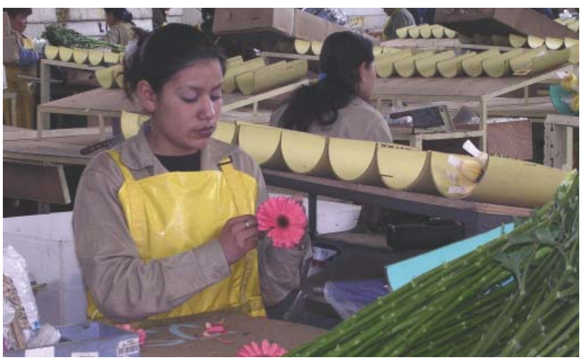
A female worker at Elite Flowers.

Sexual Violence: This is any act in which the person in power uses physical force, coercion, or psychological intimidation to force another person to participate in a sexual act against their will, or to participate in sexual interactions that lead to their victimization.