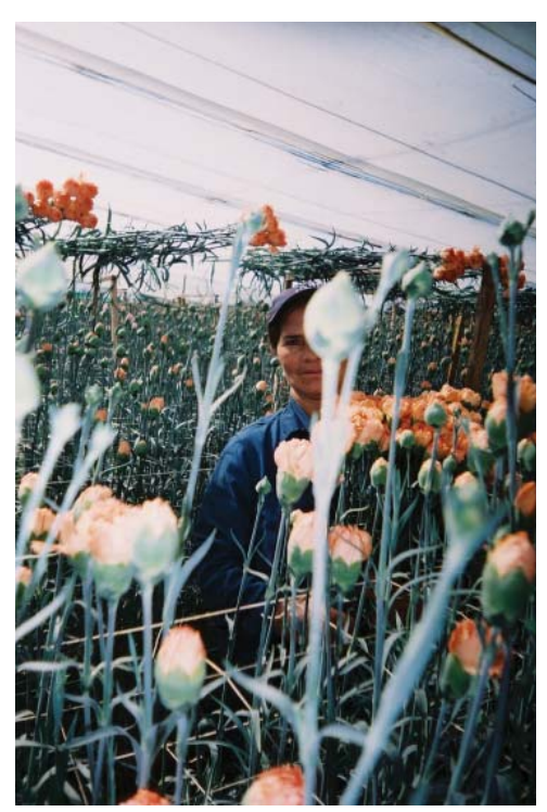
A worker in the field at a Colombian plantation.

• Write articles for your school newspaper, especially around key holidays like Valentine's Day and Mother's Day, when flower sales increase.