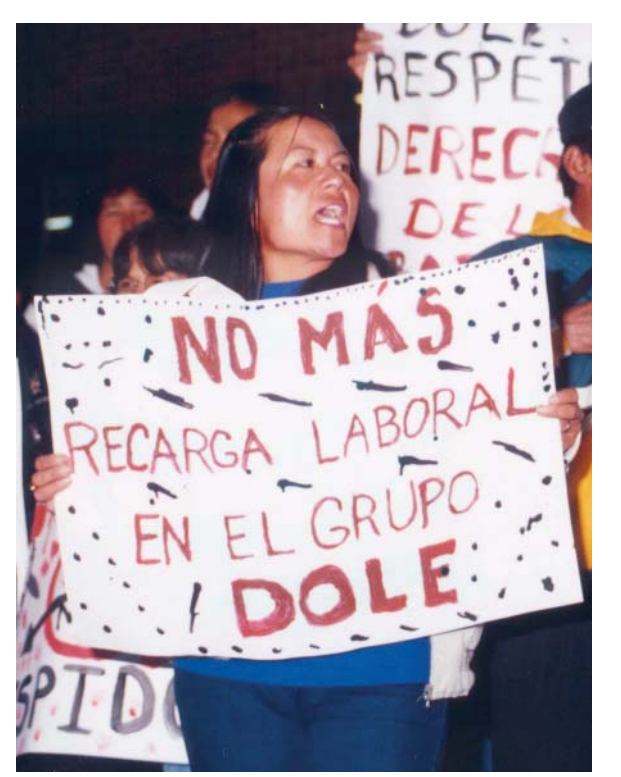
Workers protest Dole's attacks on the worker-organized union.

A similar story is being told at Dole's Flores de Fragancia Farm, but there is still an opportunity for the workers to prevail. Untrafragancia, the local independent union has been fighting for several years to negotiate a collective bargaining agreement, but Sintraflor, the Dole-friendly union, is Dole's excuse to not acknowledge Untrafragancia. The union is hoping that the Colombian Ministry of Social Protection will grant an arbitration tribunal that could possibly include ILO observers to ensure a fair outcome.<sup>xxxiii</sup>