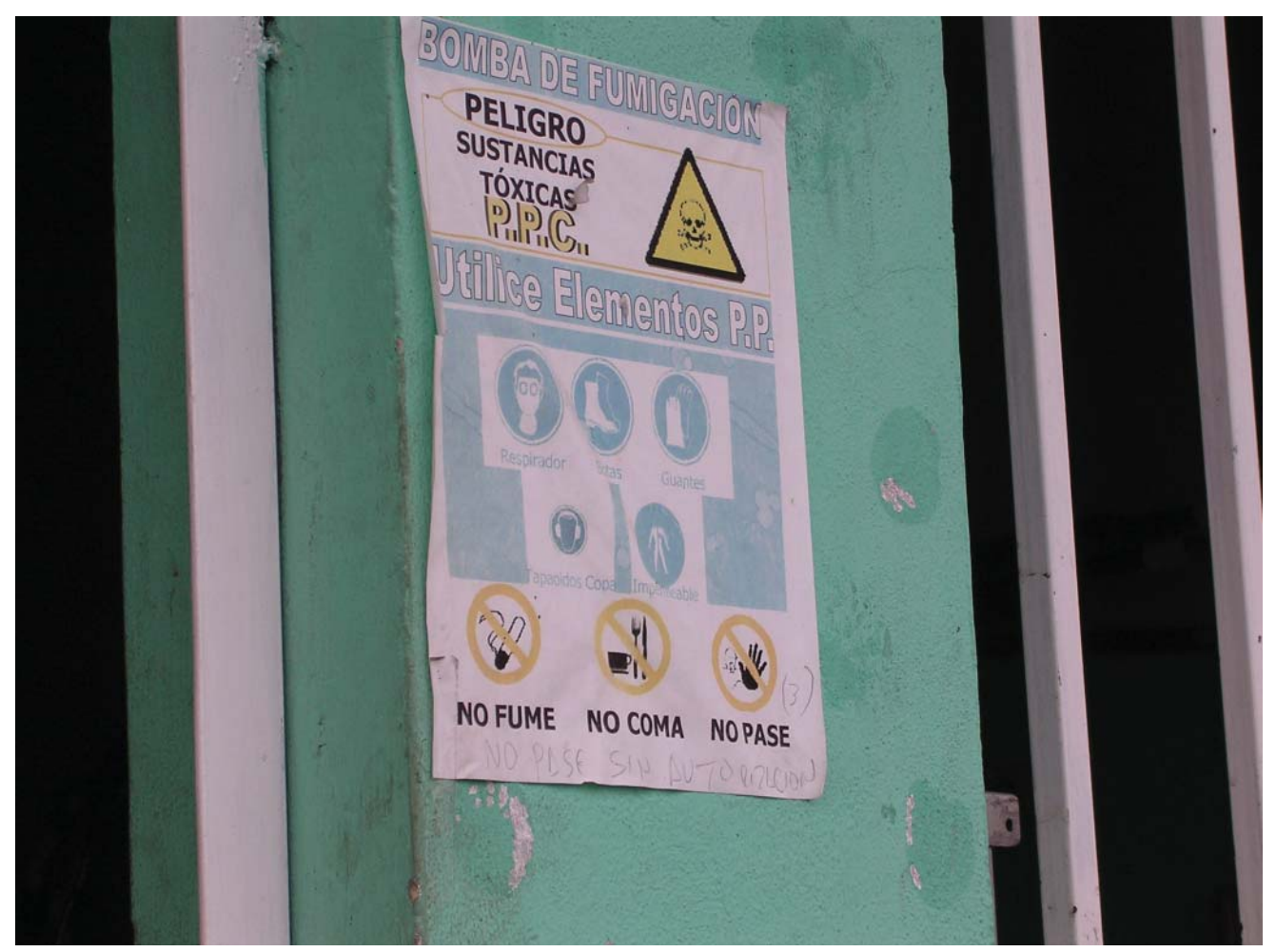
A sign warning of the dangers of the fumigation chemicals at Elite Flowers plantation.