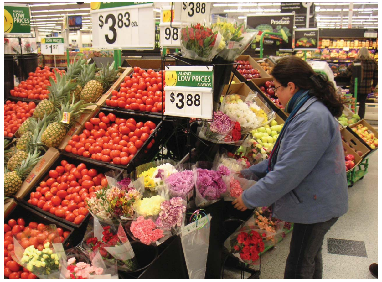
A flower worker visits a Wal-Mart in the United States, where flowers from Ecuador and Colombia are sold.