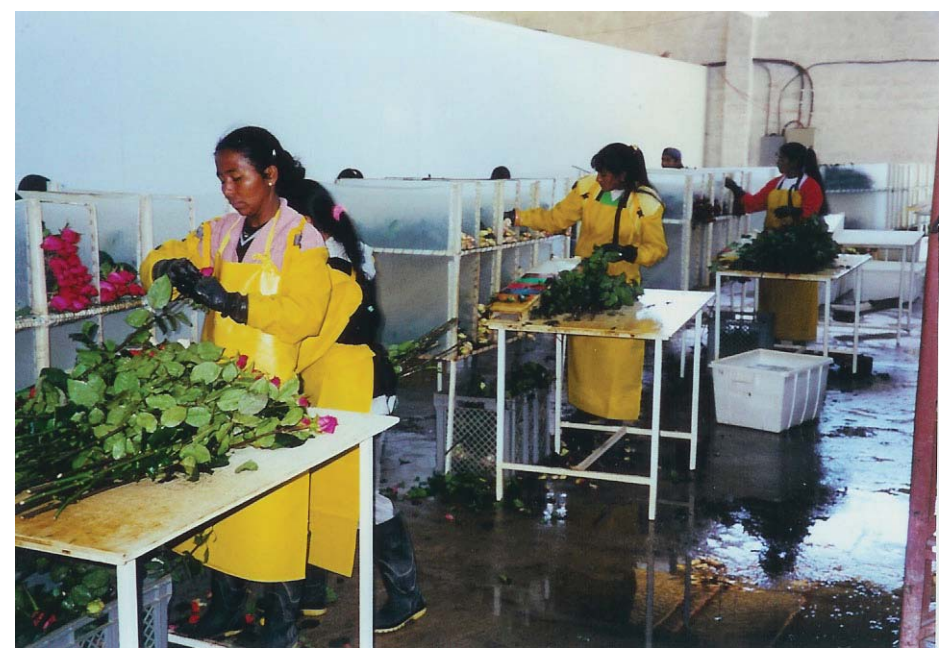
Flower workers at a plantation in Cayambe, Ecuador.