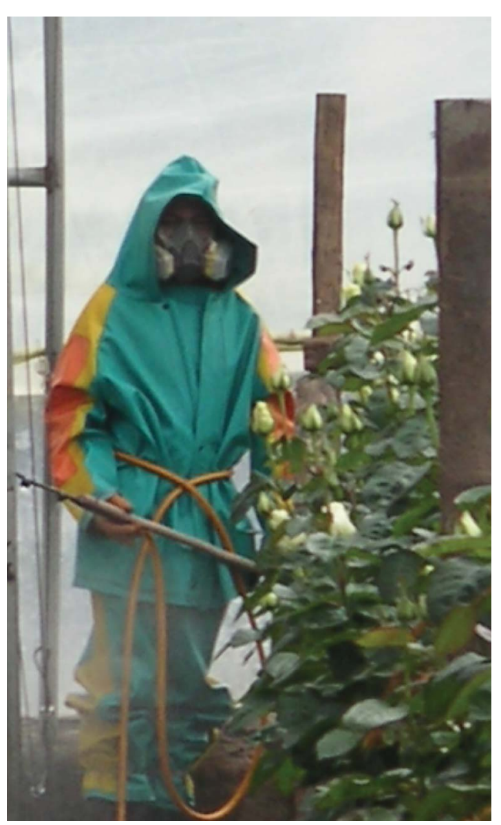
A worker spraying chemicals at a farm in Ecuador.

Genetically modified flowers raise even more questions about the effects of floriculture on human health and the environmental. In 2000, the first genetically modified flower, a blue rose, was approved by the Colombian flower industry. It contains genes derived from petunias to provide its artificial color.<sup>xxx</sup> Flower genes are now being altered genetically to make the flowers pest and disease-resistant, to increase the output of blooms and to make flowers last longer, but there is growing concern about the long-term effects of GMOs.