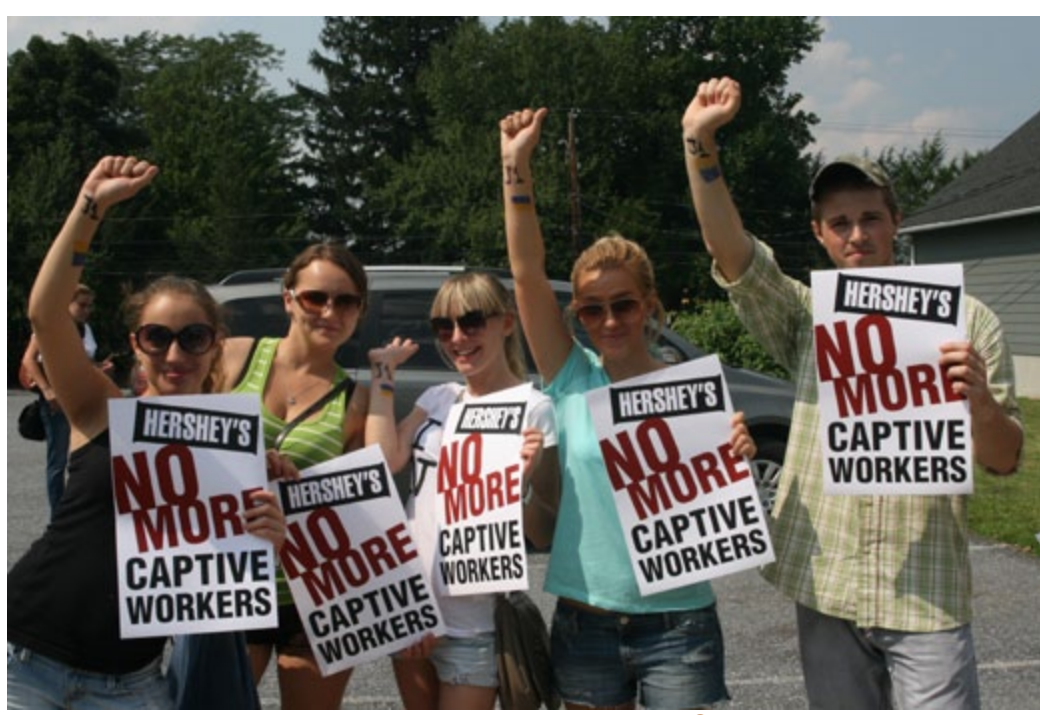
National Guestworker Alliance

charities in the United States and programs in West Africa as examples of its social responsibility, yet it refuses to set goals and make a public commitment to monitor and stop child abuse and labor rights abuses on the West African farms supplying its cocoa, despite a large body of evidence on child labor in the cocoa industry. Absent any third party certification for Hershey's products, standards of conduct for its cocoa producers, or transparency regarding its cocoa sources, it seems inconceivable that cocoa made under abusive conditions is not present in Hershey's products.