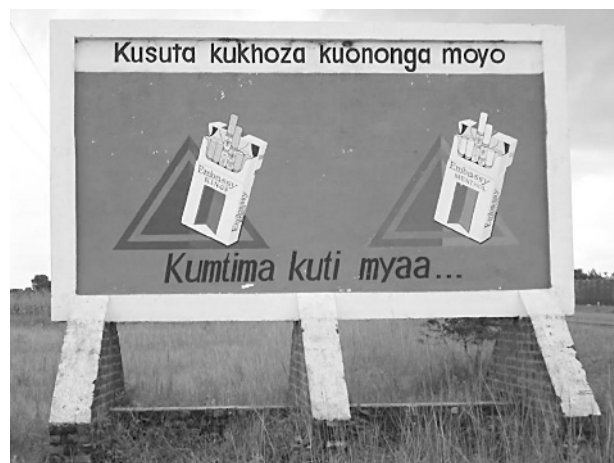
Figure 2 Mixed messages. “your heart is contented” (“Kumtima kuti myaa...”), and “Smoking may be harmful to your health” (“Kusuta kukhoza kuononga moyo”): British American Tobacco (BAT) advertisement for Embassy cigarettes, Lilongwe, Malawi, 2003. BAT used this ad as part of a larger marketing campaign to recruit new smokers during the same year that the company through the Eliminating Child Labour in Tobacco Growing Foundation (ECLT) claimed some success at reducing child labour in Malawi. 7 85 BAT aggressively markets cigarettes to women and children in Malawi to maintain and increase its market share (91%) of the local cigarette market. 97

BAT’s internal documents highlight that, rather than actively and responsibly working to solve the problem of child labour in growing tobacco, the company acted to co-opt the issue to present themselves over as a “socially responsible corporation” by releasing a policy statement claiming the company’s commitment to end harmful child labour practices, holding a global child labour conference with trade unions and other key stakeholders, and contributing nominal sums of money for development projects largely unrelated to efforts to end child labour.